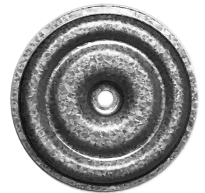
3" Metal Insulation Plate