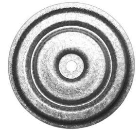
3" Recessed Metal Insulation Plate